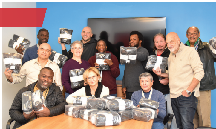
Metro Housing's Inspection Department contributed 300 pairs of socks to our Sock Drive.

During the month of November, employees at Metro Housing held a Sock Drive, donating more than 1,200 pairs of socks to the Parker Hill/Fenway ABCD (Action for Boston Community Development) in Roxbury. The socks will be distributed to those in need during the winter months.