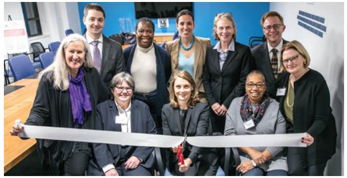
City and state officials join the Metro Housing Board in dedicating the new headquarters.

After years of hard work, careful planning, and the generosity of donors to our capital campaign, Metro Housing Boston realized the dream of owning our own home when we moved into new offices in early November at 1411 Tremont Street, across from the Roxbury Crossing Orange Line T station, on time and under budget. For more photos, visit our Facebook page at www.facebook.com/MetroHousingBoston .