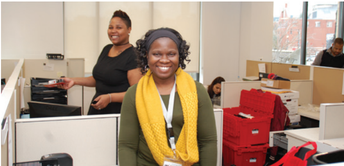
Metro Housing staff settling in on moving day.