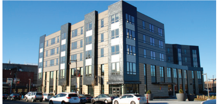
Our new home at 1411 Tremont Street, Boston.