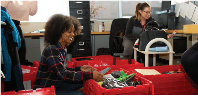
Metro Housing staff members prepare to leave their former offices at 125 Lincoln Street.