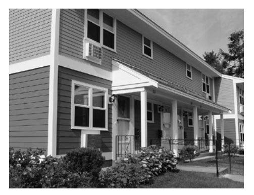
Georgetowne Homes, Hyde Park

MBHP recently entered into new partnerships designed to serve the residents of two area housing properties. These co-location partnerships are part of MBHP's ongoing efforts to make it easier for residents to access services in the communities we serve.