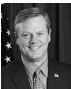
The Honorable Charles D. Baker Governor The Commonwealth of Massachusetts