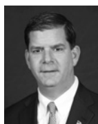
The Honorable Martin J. Walsh Mayor City of Boston