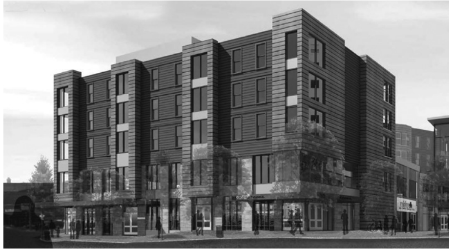
An artist's rendering of MBHP's future home in Roxbury Crossing.

Corcoran is eager to facilitate bringing MBHP's services into