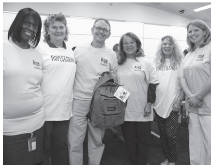
Ropes & Gray employees held a “packing party” to get the backpacks ready.

MBHP also partners with Cradles to Crayons to distribute hundreds of backpacks to children of participants in our other programs.