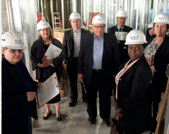
Representatives from our corporate sponsors and members of the Board of Directors get a tour of what would soon become our new home in Roxbury Crossing.