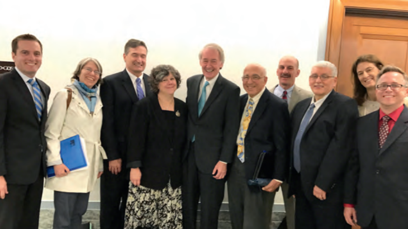
Members of the Regional Housing Network, including Metro Housing|Boston, with Massachusetts Senator Ed Markey at his Washington D.C. office.