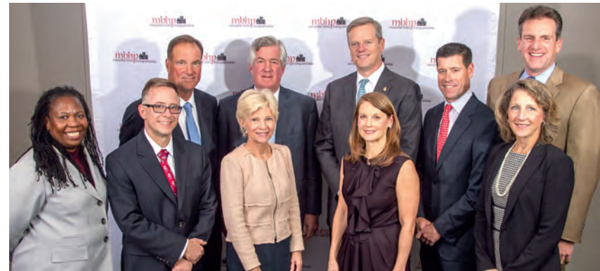
Honorees, co-chairs, Board members, and state officials gather at the 9th Annual Founders Celebration.