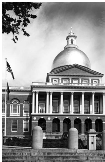
Massachusetts State House

MBTA: Take the Red or Green Line to Park Street Station