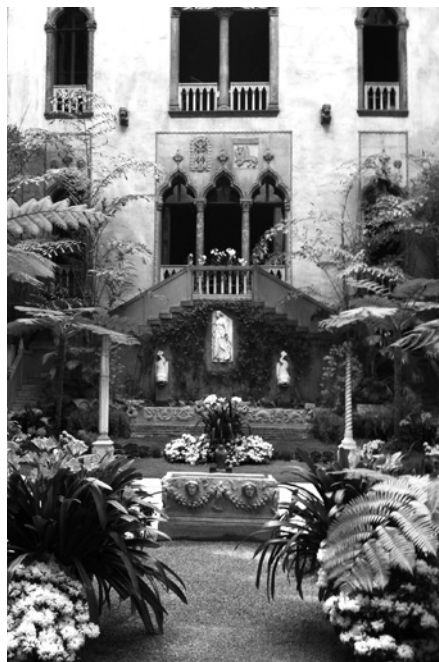
Isabella Stewart Gardner Museum

MBTA: Green Line E train to Museum of Fine Arts Station