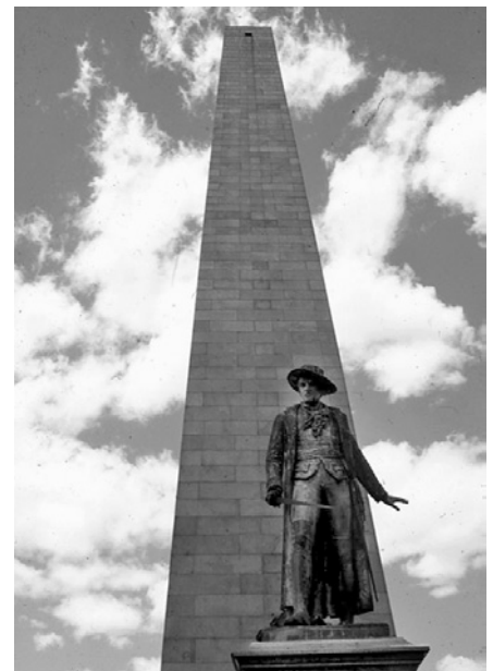
Bunker Hill Monument